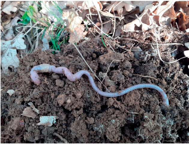
Fig. 2. Living specimen of species Cernsovittovia strumicae in an oak forest on the Western slopes of Kopaonik Mt.